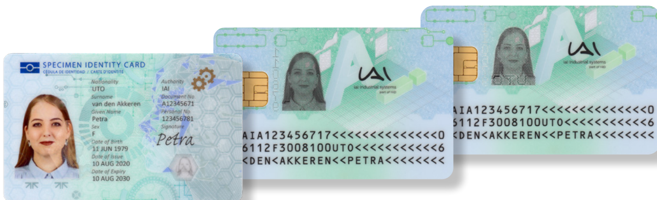
ImagePerf®/REV on ID card's front, back and through the light vision

ImagePerf, ImagePerf/TLI, ImagePerf/VLI and ImagePerf/REV are available exclusively for governmental documents such as passports, ID cards, resident permits and driver licenses. The features are available as options on IAI's BookMaster® One and CardMaster® One systems.