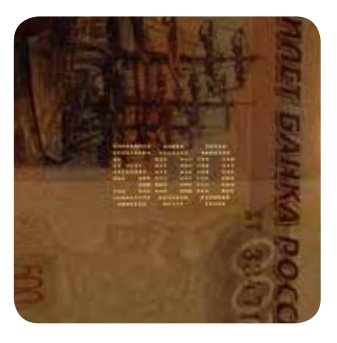
Denomination pattern in Russian banknotes