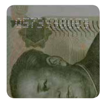
Unique serial number in Chinese banknotes

De Run 5406 5504 DE Veldhoven The Netherlands