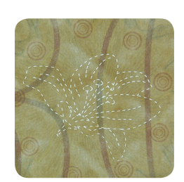
The LogoPerf security feature